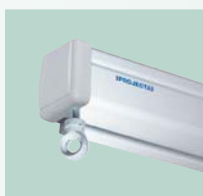
High quality manual projection screen