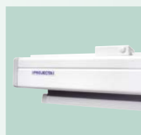
Easy Install with plastic mounting brackets