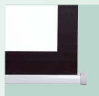
Triangular slat bar