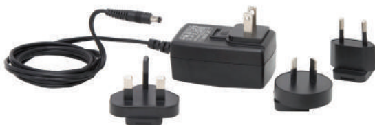
PSU-5VU Universal DC adaptor (Part No: 1180 0049)

Wall power adaptor with interchangeable plug for international use. Universal input: 100-240 V AC, 50-60 Hz, Output: 5V DC, 2.5A