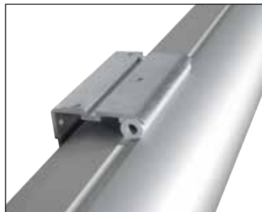
Laterally adjustable mounting brackets