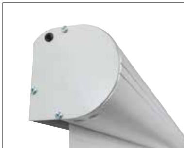
Designer round aluminium case