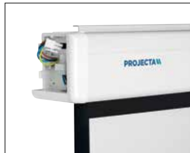
Plug and Play accessories