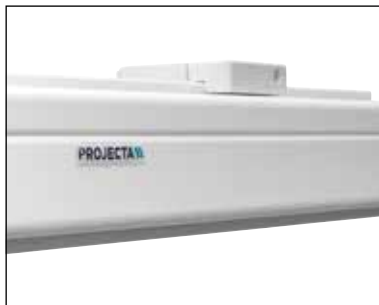
Easy Install with plastic mounting brackets