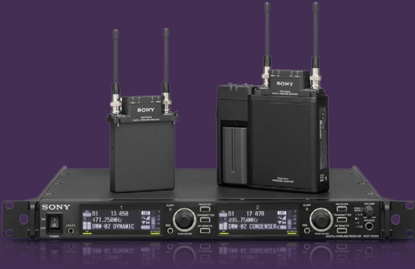
DWR-R02DN Rack-mount Receiver